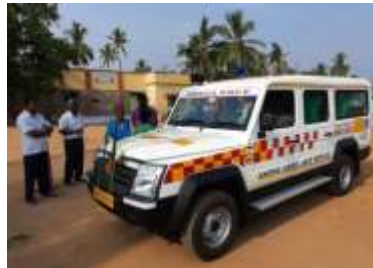
Anisha's Ambulance Service

Everyone in the region expressed it was a gift for the region during covid-19 pandemic as none of the vehicles came forward to take the covid patients to hospital. At present cases like covid, accidents and cardiac patients are shifted to hospital and saved many lives.