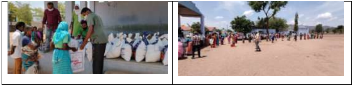
Food kit distribution

A huge population of this region comprises landless laborers, small and marginal farmers, who migrated to nearby cities and states in search of jobs. Apart from working in mines/quarries, they also work in the cities as construction workers, garments factory workers, drivers, painters, carpenters, maids, and other labour-intensive jobs. The pandemic lockdowns forced these migrant families to return to their villages. They lost their jobs and thus their wages. Their situation is painful as poverty is hitting them hard without jobs and no land for cultivation. In this circumstance, Anisha and St. Joseph's Hospital and teachers together distributed 4100 dry food kits for the migrant and needy families. A detailed report of Covid-19 relief is attached in Annex-1.